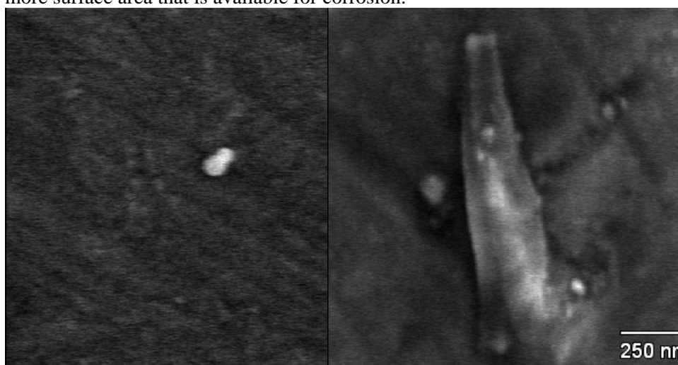
SEM of ALSN4 (MIC-treated & Control )

In case of ASLN 1 and St 304 (tables and graphs not shown) it is observed that. the initial reaction rate i.e the first peak is lower than the second peak, which normally happens due to presence of acid. Probably in the first stage pitting type of corrosion may have occurred and due to that more surface area has been produced. As a result in second stage corrosion, material lost will be more due to more surface area that is available for corrosion.